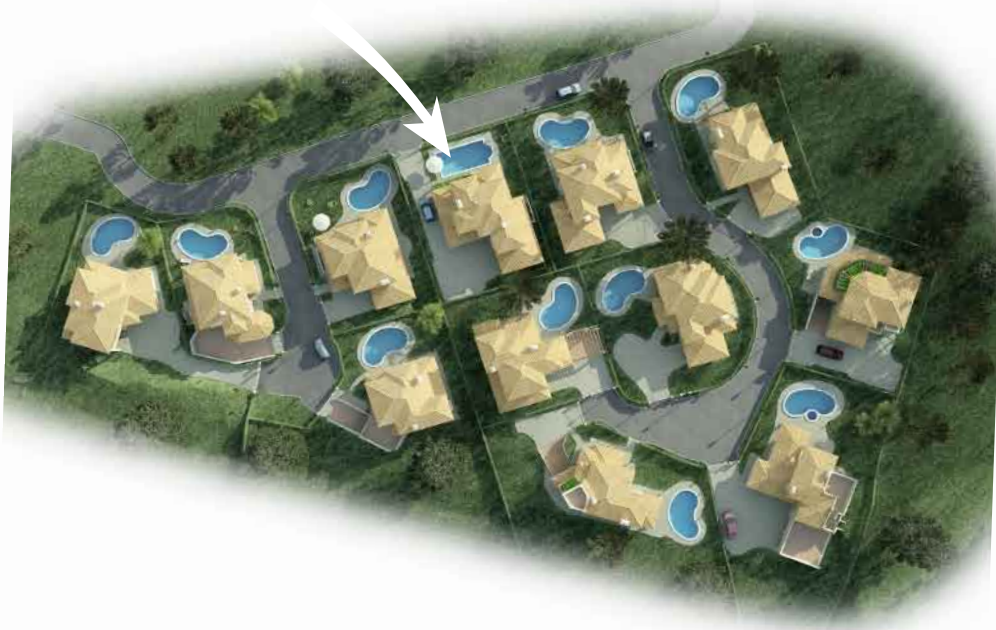
Location on the site