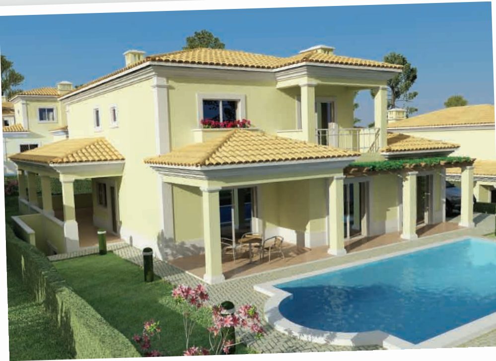
Villa No. 8